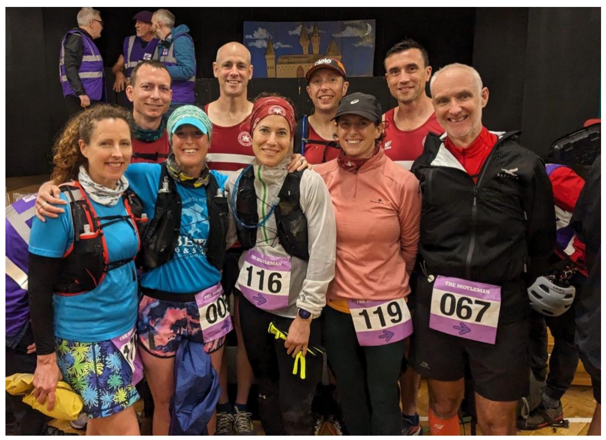
Harriers at the Moyleman Marathon.

The weather was fairly kind to the runners after the recent relentless heavy rains.